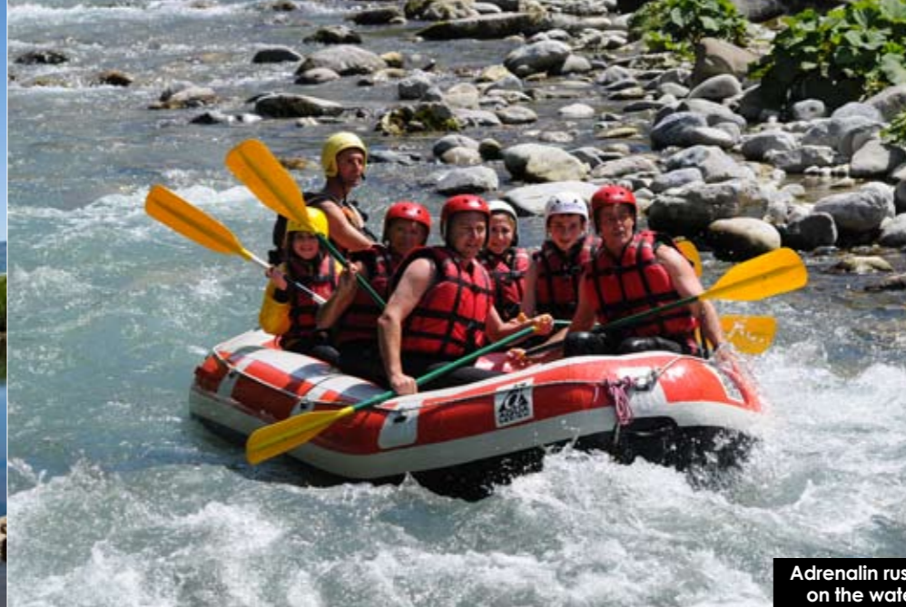
Adrenalin rush on the water