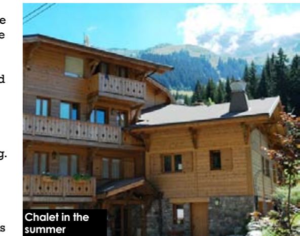
Chalet in the summer

And of course being France, the food is exquisite – all in all the perfect break for active families!