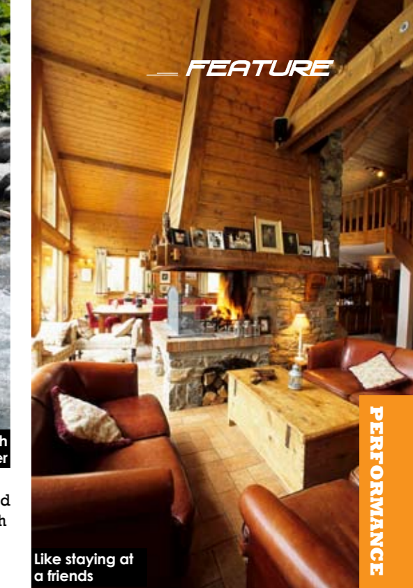
Like staying at a friends