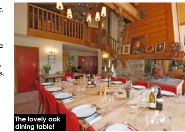
The lovely oak dining table!