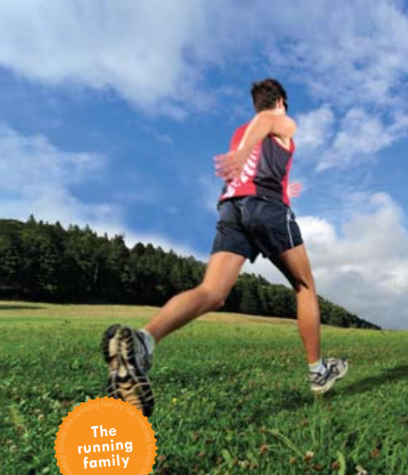
The running family