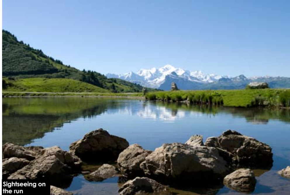
Sightseeing on the run